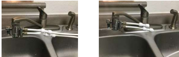
On picture - dual diverter. Single diverter works the same way.

If you prefer not to keep the reverse osmosis (RO) system on the countertop, the simplest method is to leave the diverter attached to the spout at all times and disconnect the RO system at the union fitting.